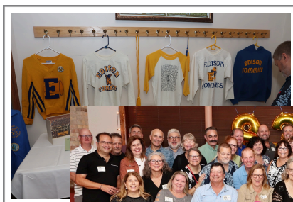
Class of 1983

The 2024 Edison Community and Sports Foundation golf scramble will be held at Columbia Golf Course on July 29, 2024. Dinner will follow the tournament in the Columbia Manor Reception Hall. Follow @ECSFTournament on twitter, like the Edison Community & Sports Foundation Facebook page and this newsletter for details and updates.