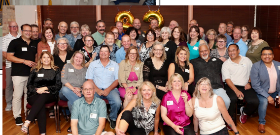
Class of 1973